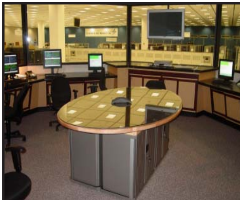
LOCKHEED MARTIN CONTROL CENTER