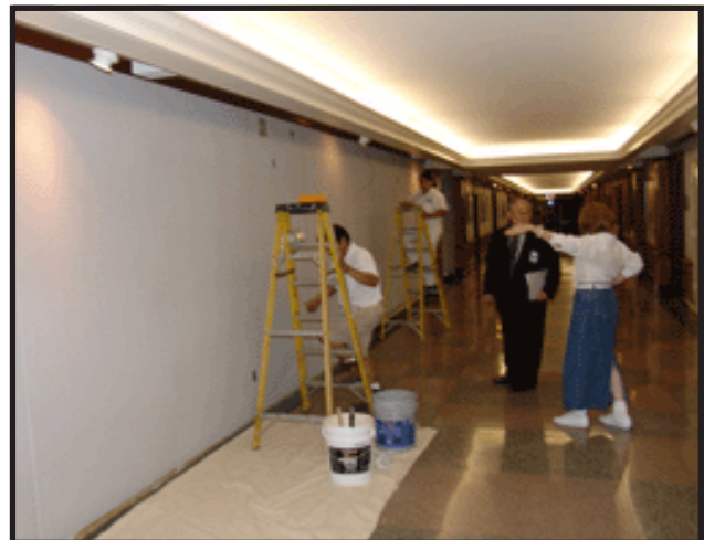
PREPARING TO INSTALL DISPLAY CASES IN THE PENTAGON