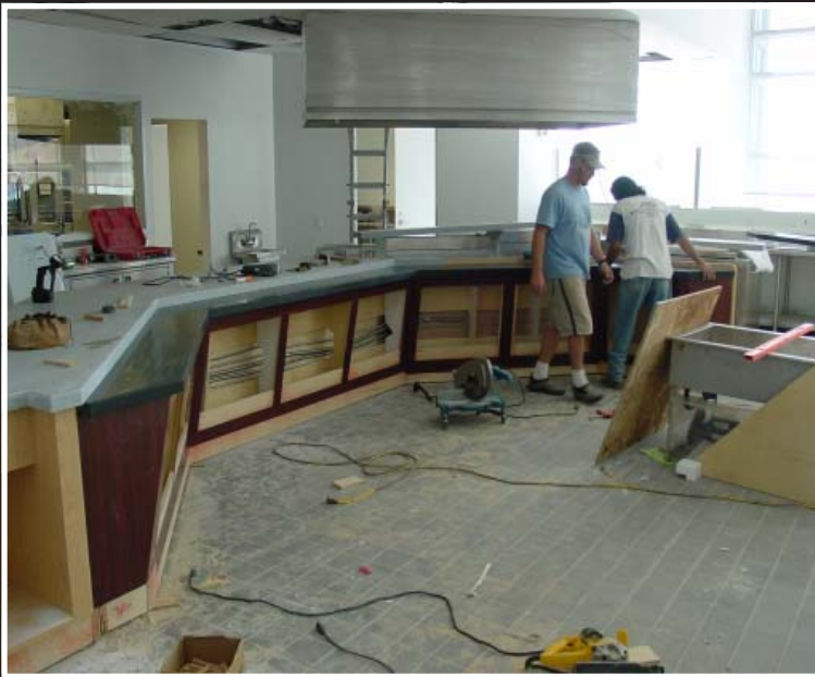
SANDRA DAY O'CONNER FEDERAL COURTHOUSE - PHOENIX, AZ