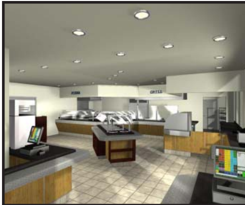
SAN ANTONIO TEXAS COURTHOUSE