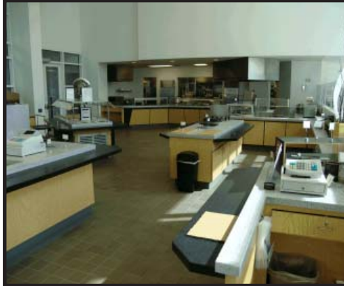
PHOENIX ARIZONA COURTHOUSE