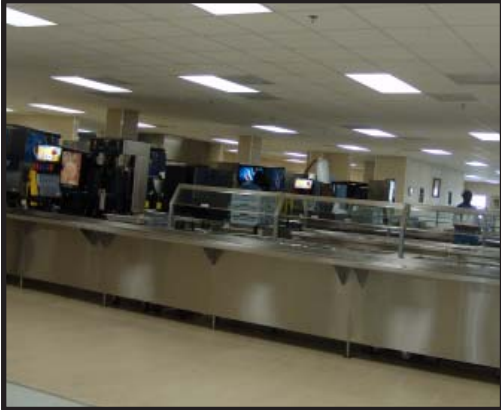
TEMPORARY DINING FACILITY - FORT JACKSON, SC