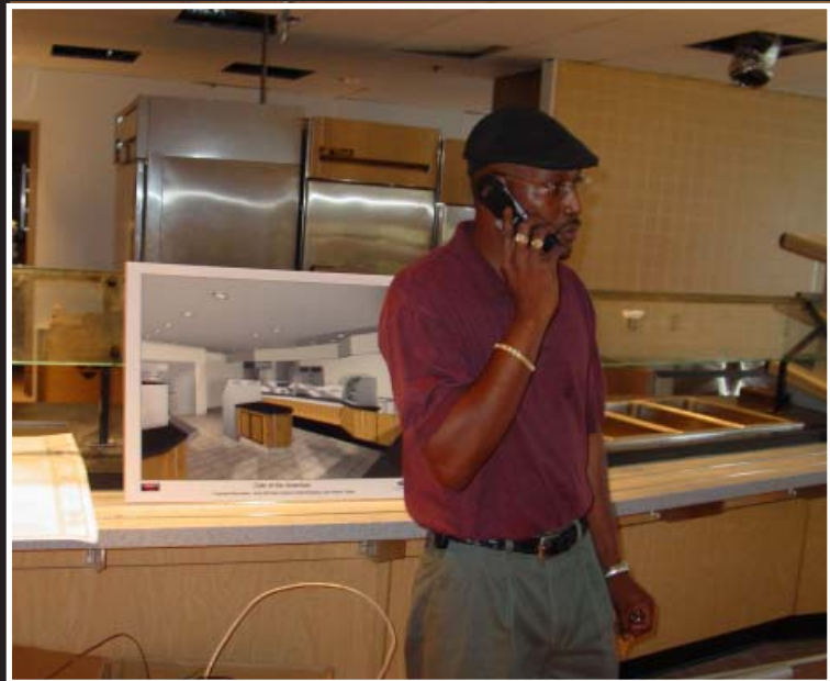
GSA PBS FEDERAL BUILDING - SAN ANTONIO, TX

CMARK IS A SDVOSB (SERVICE DISABLED VETERAN OWNED SMALL BUSINESS IAW PL 108-183)