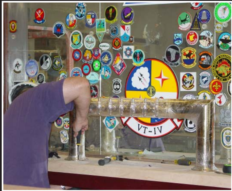
MUSTIN BEACH OFFICER'S CLUB - PENSACOLA, FL