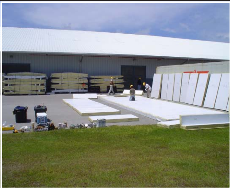
US NAVAL BASE - DIEGO GARCIA

CMARK HOLDS ARCHITECTURAL AND GENERAL CONTRACTOR LICENSES