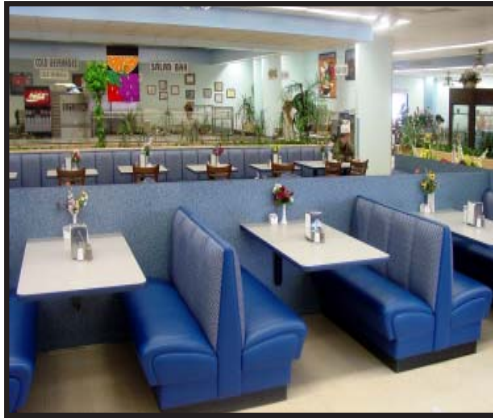
FORT IRWIN DINING FACILITY