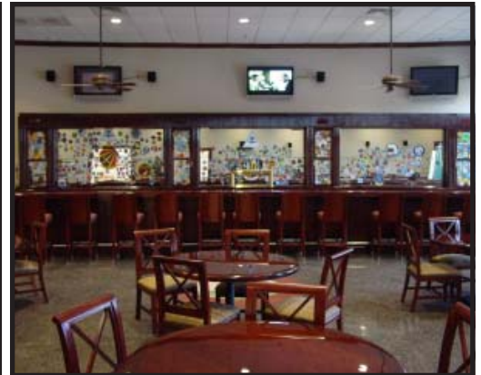
PENSACOLA O CLUB - BEER SYSTEM