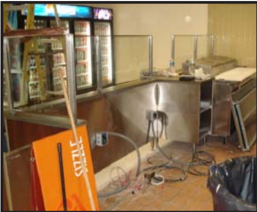
HATO REY FEDERAL BLDG. - CAFETERIA (RENOVATIONS)