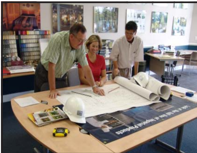
ENGINEERING STAFF IN COLUMBIA, SC

CMARK'S ABILITY TO CONCEIVE, PLAN, AND DESIGN ASSURES THE CUSTOMER OF A FACILITY OFFERING MAXIMUM FUNCTIONALITY.