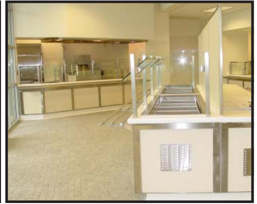
IRS BUILDING FRESNO CALIFORNIA