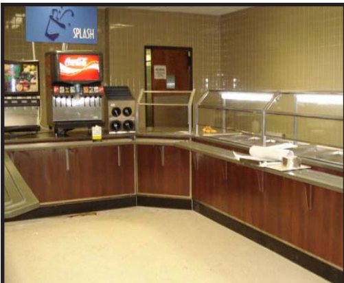
HATO REY FEDERAL BLDG. - CAFETERIA (COMPLETE)