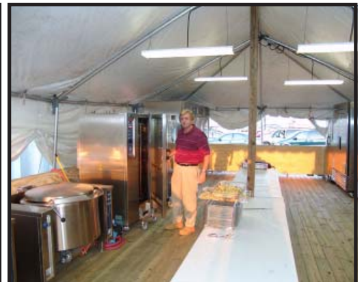
NEW ORLEANS KATRINA RELIEF AID