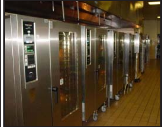
CAMP LEJEUNE COMBI