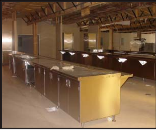
TEMPORARY DINING FACILITY - FORT JACKSON, SC